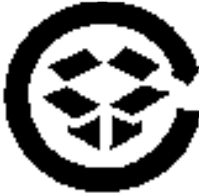
Exhibit 6 - “Corrugated Recycles” Symbol and Statement