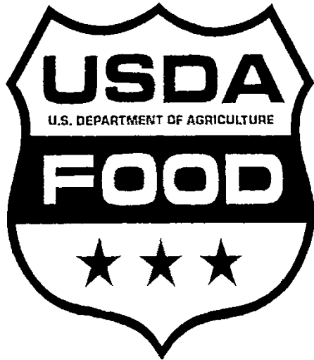
Exhibit 3 - Sample Alternative Label for Shipping Containers